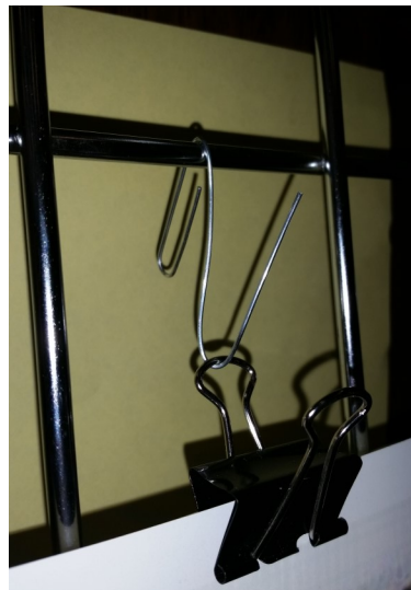
Binder clip and paperclip method