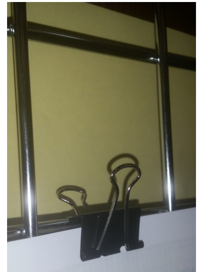
Binder clip only method